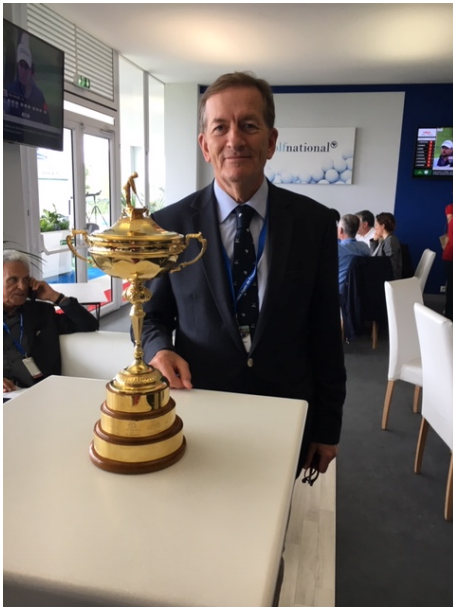
The RYDER Cup

Golf National “Albatros” Ryder Cup Course And “Aigle”