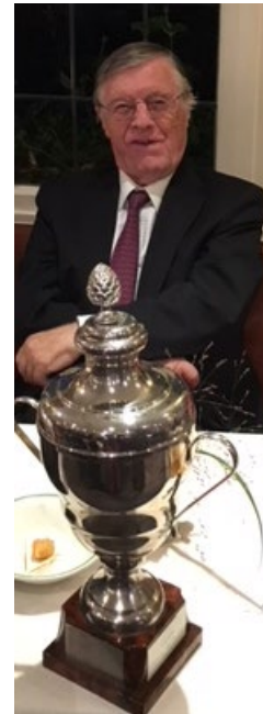
Etienne Duvieusart Cup